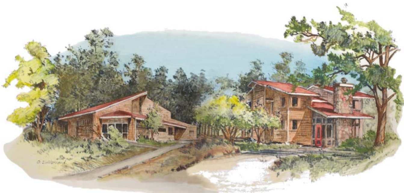
William Penn Mott Jr. Training Center